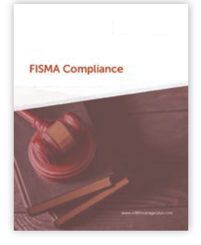
Download FISMA compliance checklist