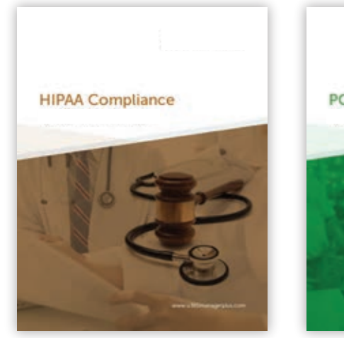
Download HIPAA compliance checklist