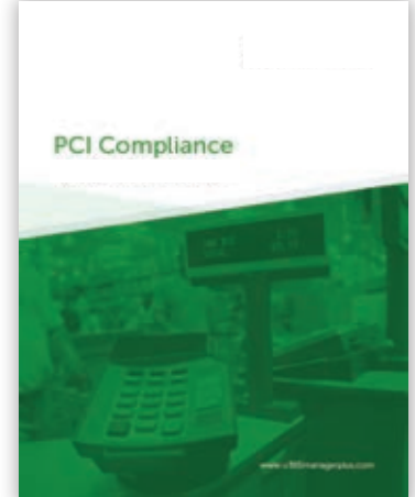
Download PCI DSS compliance checklist