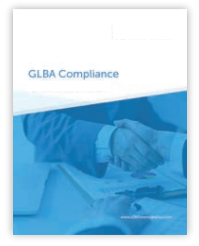
Download GLBA compliance checklist