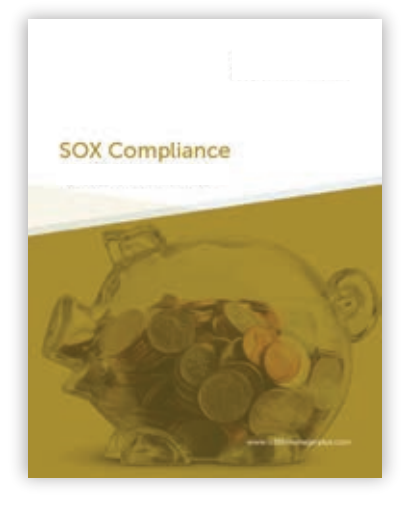
Download SOX compliance checklist